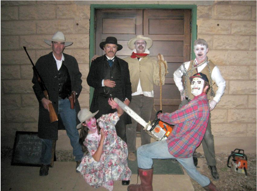
Characters encountered the Halloween Night walk