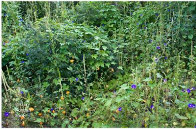
arizona poppy woolly morining glory 08232...