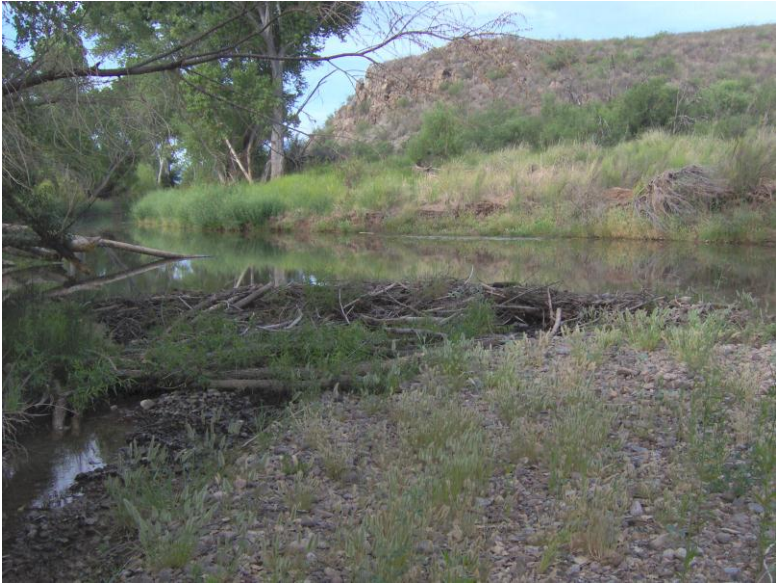
Riparian habitat and beaver dam with rocky terrain and elevation change in the background