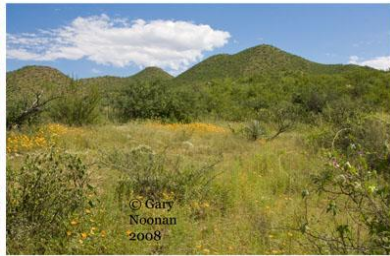
countryside w poppies 08232008_MG_808...