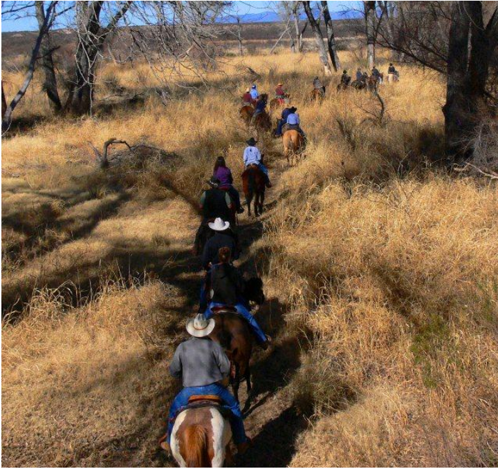
A ride along the San Pedro River on a warm January day