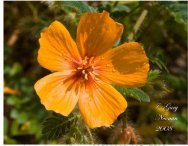
arizona poppy flower 08232008_MG_7593....