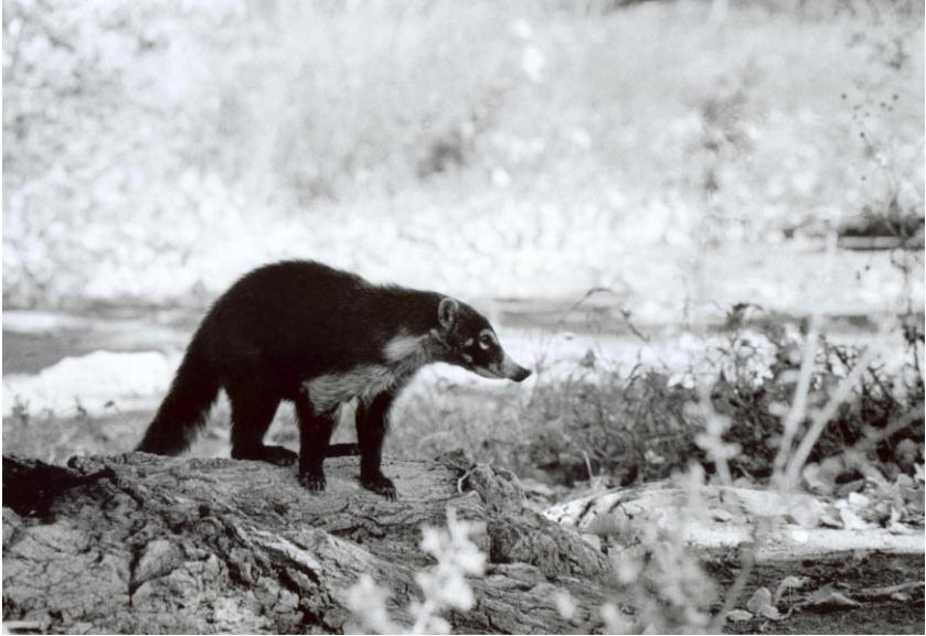
This coati was seen at the San Pedro House

the river. And do not be surprised if a curious fellow asks where you are from.