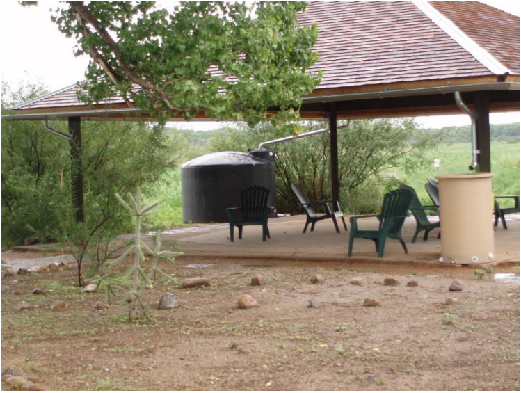
The amphitheater at the San Pedro House with its new rain gutters and water storage containers