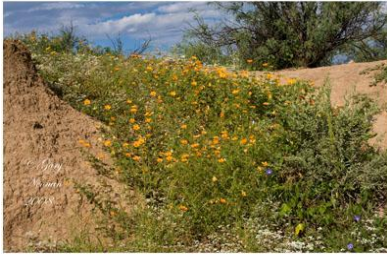
arizona poppy wooly tidestromia woolly m...

identify and a joy to watch. Come take a walk with us on the grasslands