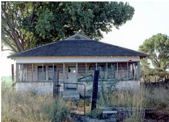
The San Pedro House in 1987 before restoration

welcoming visitor center and bookstore. In short, the preserve would be much less accessible, and visitors would have much less information about it.