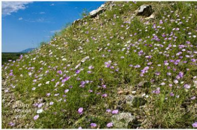
birds foot morning glories on hill 08232008...