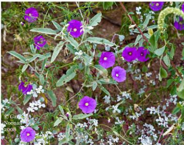
birds foot morning glory and woolly tidestro...