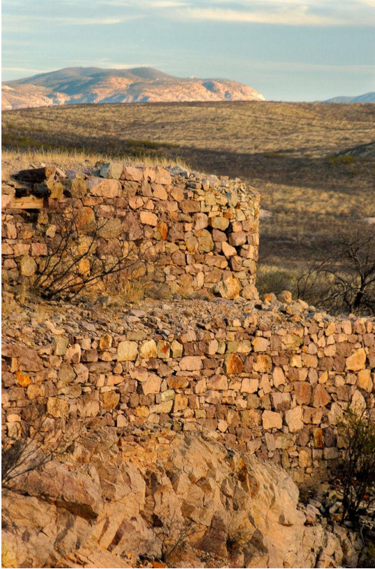
The foundation is all that remains of the old Gird Mill

available at the trail head and interpretive signs offer additional information.