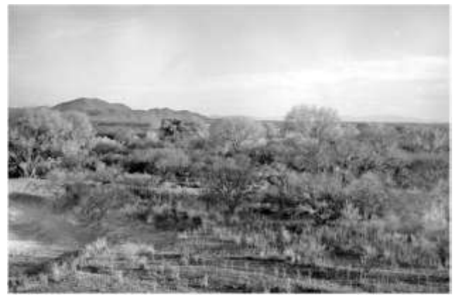
Babocomari Babcomari River near junction with San Pedro River in 1962. Showing entrenched river on left with many trees. Stake 150. J. R. Hastings. Trees & brush obscured view of San Pedro River. (Courtesy of the USGS Desert Laboratory Repeat Photography Collection).