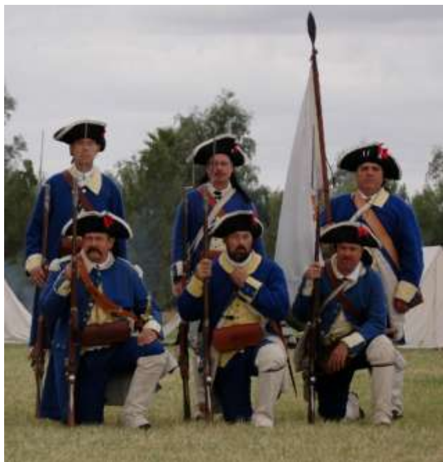
Spanish Presidio re-enactors.