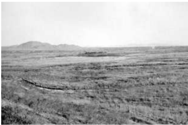
Example of massive habitat change. Babocomari River ca. 1890 near junction with San Pedro River. Showing marshy, treeless conditions (except for trees on raised area where Fairbank built). G. Roskruge.