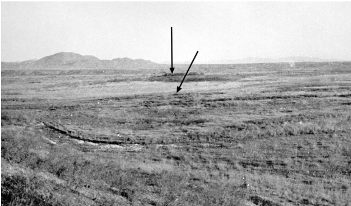
Fig 1. Babocomari River ca. 1890 near junction with San Pedro River. Showing marshy, treeless conditions (except for trees on raised area where Fairbank built — indicated by vertical arrow). Slanted arrow points to San Pedro River. G. Roskrug. (Courtesy of the Arizona Historical Society/Tucson, AHS Photo Number PC114_B2_F31_46404.)

The six episodes of prehistoric arroyo formation strongly argue against the belief that the removal of beavers caused arroyo formation.