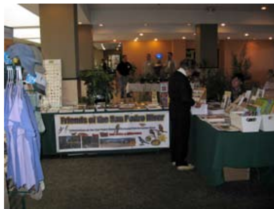
FSPR booth at Master Gardeners Convention.