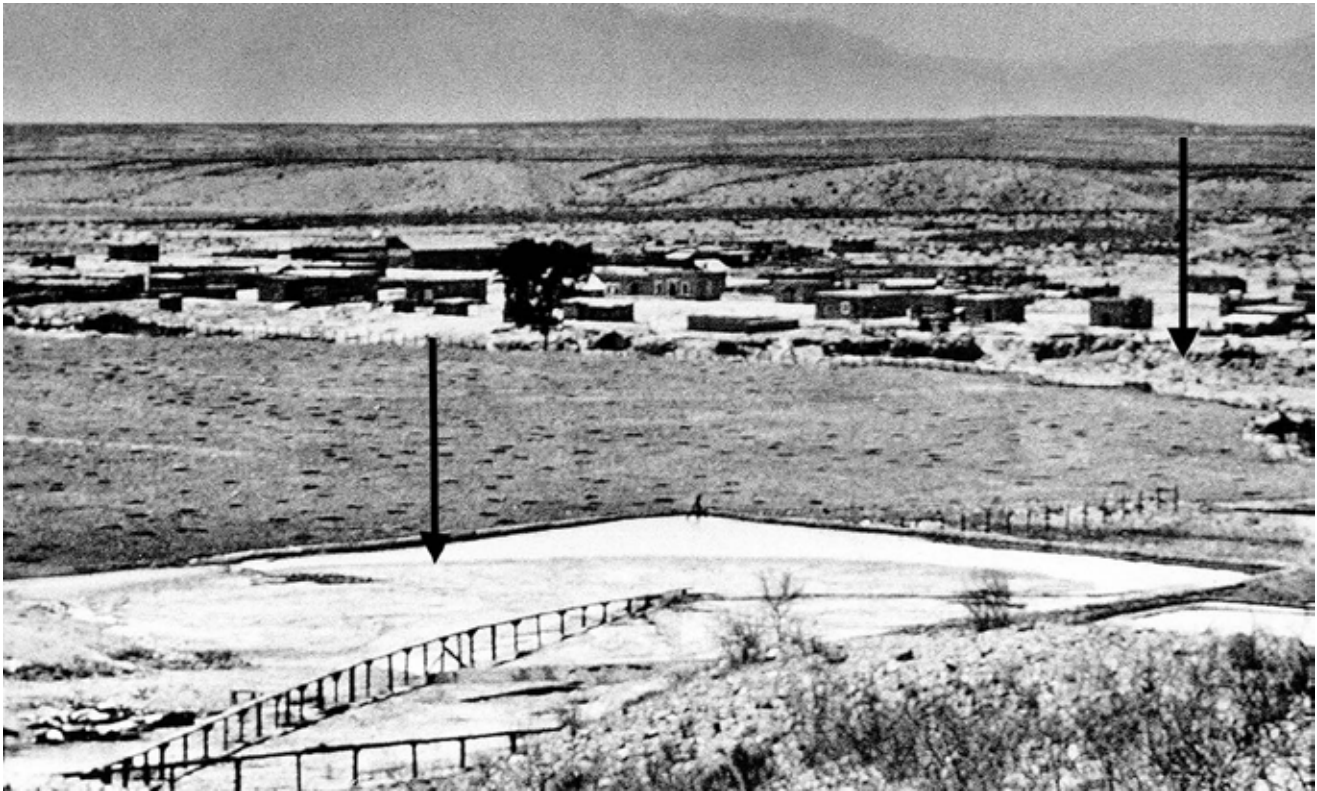
Fig. 2. San Pedro River at Charleston ca. 1880. Massive floods had removed most plants from along the river. The right arrow denotes the barren, narrowly entrenched San Pedro River. The left arrow points to a tailings pond associated with Gird Mill.

The deposition of sediment in the San Pedro River since the 1940s also argues against them as necessary to prevent downcutting of waterways. Beavers were not reintroduced to the river until 1999-2001, but sediment deposition occurred in their absence. In addition, Turner et al. (2003) reported that in many areas (other than the San Pedro River), beaver populations rebounded by the 1850s, well before arroyo downcutting began.